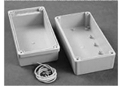
Open view ABS