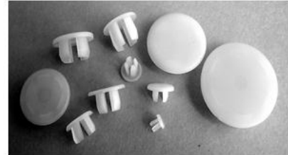
10 sizes Non Locking Hole Plugs