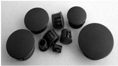
9 sizes Locking Hole Plugs