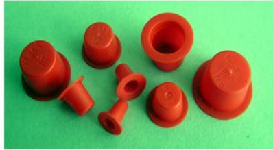
8 sizes T Plugs/Caps