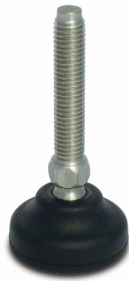
Two piece part