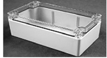
16-1554 '2CL' Series