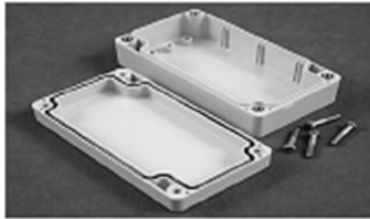
26-1554 '2' Series Flat lid, clear and smoked lid options